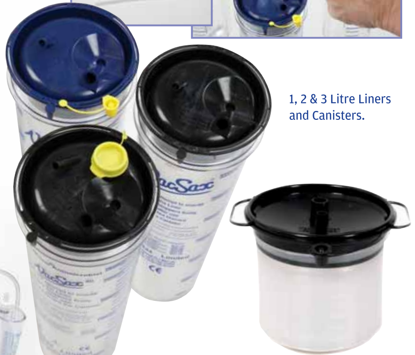
1, 2 & 3 Litre Liners and Canisters.