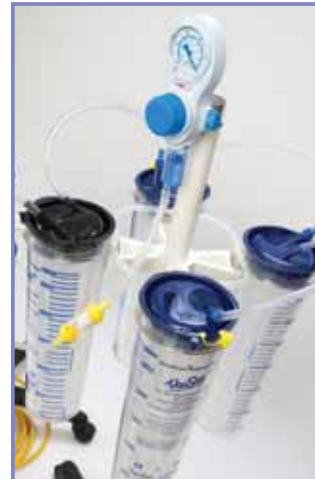
Cascade Stand detail

Determination of antibacterial activity using modified ISO22196 Certificate Number -MSSL-LRN-1017863.1A-ISO-22196 Certificate Number -MSSL-LRN-1017863.1B-ISO-22196